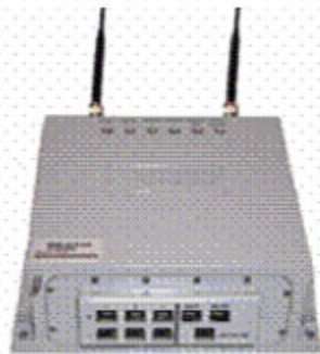
model 527-2 Wireless Mesh Access Point